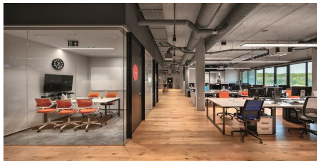
Bild 3 + 4: The company headquarters not only has offices and meeting rooms, but also a fitness area, a restaurant and a training centre. This building is just one part of the high-tech Infobip campus, however.