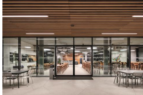
Image 1 + 2: The IT and telecommunications specialist Infobip trusted in Zumtobel's expertise for the lighting at its new headquarters in Vodnjan/Croatia. A lighting solution with optimal glare control and high flexibility was required.